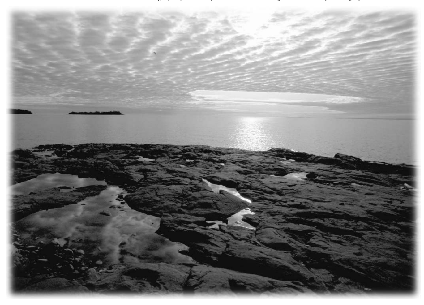
Photograph of Lake Superior's North Shore by Dave Hansen, courtesy of Great Lakes EPA.

Volume 5, No. 4 The SandBar $\infty Page 19$