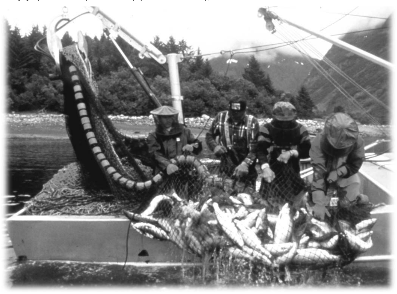
Photograph of Alaskan salmon fishermen courtesy of NOAA's Photo Library, Fisheries Collection.

Six fishers filed the breach of contract claim against ISA, which had to be certified as a class action. The Alaska Superior Court certified the class, which totaled 110 members, as "[a]ll fishers, who in the year 2000, took salmon from the Egegik District and sold these salmon to International Seafoods of Alaska, Inc."4 ISA objected to the certification and requested that the claims of fishers who did not respond to discovery be dismissed. The court maintained the certification and held that only evidence provided in discovery could be used at trial, thereby limiting witnesses at trial to those plaintiffs who had responded to discovery requests.<sup>5</sup> ISA also contested the single jury verdict form used for the entire class, which the court found