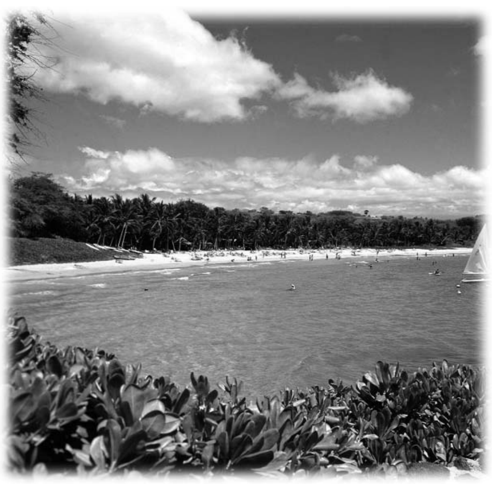
Photograph of Hawaiian shoreline