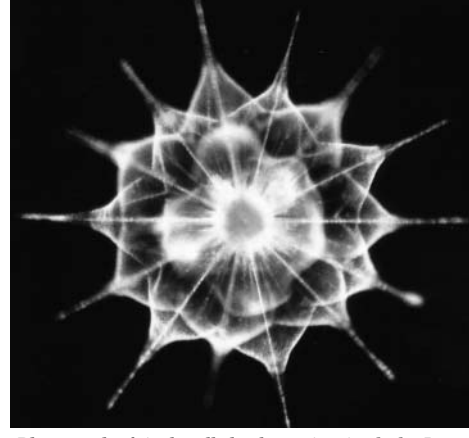
Photograph of single-celled eukaryotic microbe.

The Census of Marine Life has released its annual report, which describes new undersea creatures discovered by scientists in 2006. Nearly two-miles deep in the Atlantic, scientists found shrimp living around a vent releasing near-boiling water into the sea. Other surprising findings included the discovery of a type of shrimp that were thought to be extinct, a fish school the size of Manhattan located off the New Jersey shore, a four-pound rock lobster off the coast of Madagascar, and a new "furry" crab discovered near Easter Island. The census is supported by international governments, divisions of the United Nations, and private conservation organizations.