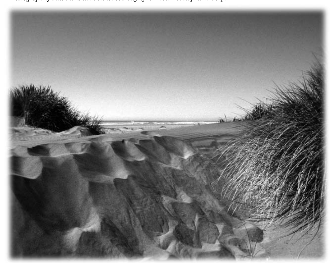
Photograph of beach and sand dunes

Volume 5, No. 4 The SandBar $\mathbb{Y}\) Page 5